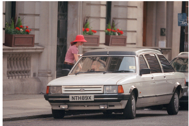
Figure 3. Player enters the car for the climax of the game.

The game is staged over a period of about ten days in each city it visits, typically being played continuously for six to eight hours each day. Each street player’s experience last for a maximum of one hour and up to twelve street players are active at any one time, with new players being added as current ones complete the experience. Up to twenty online players may be present at a time. The ‘game zone’ consists of around one square kilometre of city streets.