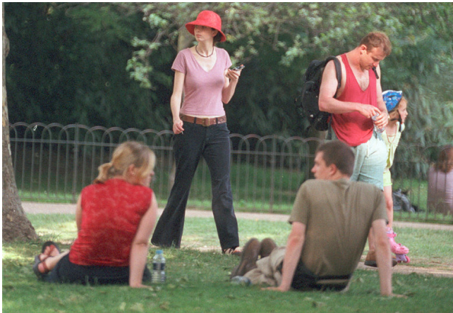
Figure 1. A street player uses their PDA to follow clues.

URAY is a game of mystery in which players, equipped with PDAs, undertake a journey through a city in search of a shadowy and mysterious character. These ‘street players’ are introduced to the game through a ritual briefing in which they are asked to hand over all of their personal possessions, bags, phones, money and identification in return for the PDA that they will use to play the game. Thus prepared, they are sent out into the city to follow a series of often ambiguous textual clues that respond to their current location and lead them on a convoluted dance through the city streets in search of this character’s office. Their progress is monitored throughout by remote online players who can track their position and can communicate with them via text messages (street players respond with short audio messages), and who may provide them with additional guidance or hindrance, for example steering them towards or away from the office.