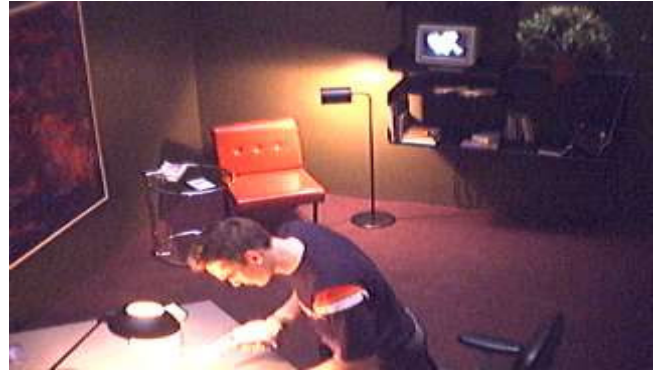
Figure 2. Surveillance view of a player in the office.

them inside over a surveillance camera and are asked the same questions about trust and commitment.